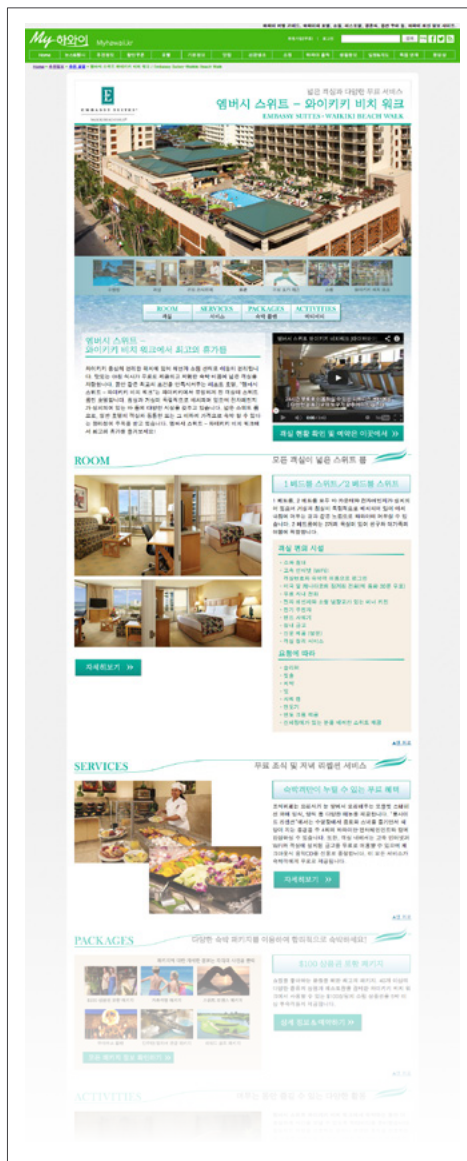
Korean Premium Advertorial - Embassy Suites - Waikiki Beach Walk