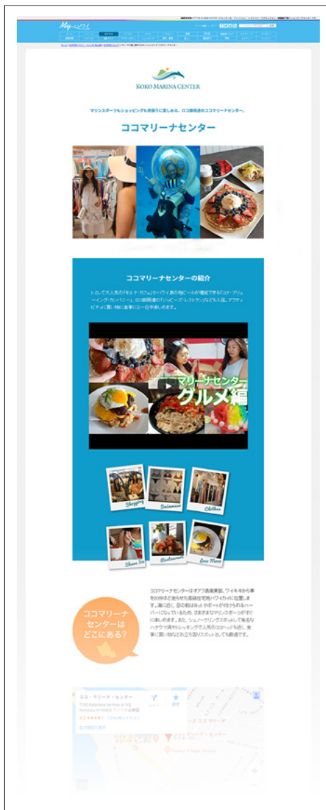
Japanese Premium Advertorial - Koko Marina Center