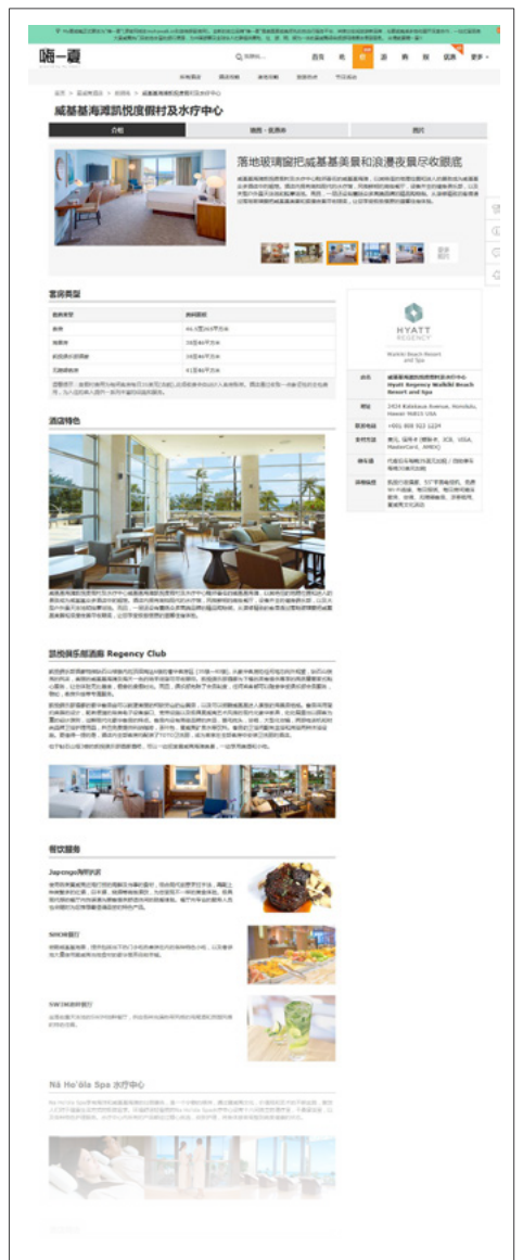
Chinese Premium Advertorial - Hyatt Regency Waikiki Beach Resort & Spa